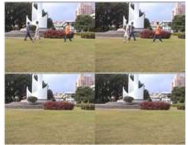
Fig.4- Video Inpainting Example

lines (isophotes). Isophote directions are obtained by computing at each pixel along the inpainting contour a discredited gradient vector and by rotating the resulting vector by 90 degrees. This intends to propagate information while preserving edges to handle the missing region with composite textures and structures, patch priority is defined to encourage the filling-in of patches on the structure. Wexler [14] defined an optimal function to search the best matching patch in a foreground and use the found patch to repair the moving foreground. This algorithm filled the video frame patch by patch. Space-time completion of video (Wexler, Shechtman, & Irani, 2007), Wexler et al. consider video inpainting as a global optimization problem, which inherently leads to slow running time due to its complexity.