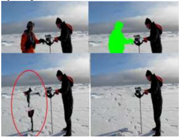
Fig.1 Person removal by using Image Inpainting

The region of unwanted information in the bounded variation image is removed by using image inpainting.